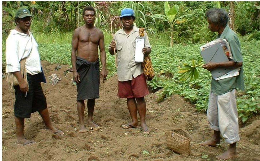
(Farmer – Scientist Consultation (Keravat, PNG, NARI))

4 German Aerospace Center, Germany (DLR)