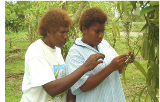
Farmer vanilla training (Keravat, PNG, Gadi Ling, NARI, 2008)