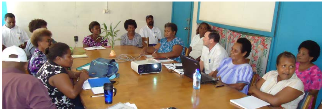
(Collaboration between scientists and women farmers from PNG, Solomon Islands and Vanuatu in Honiara, Solomon Islands)