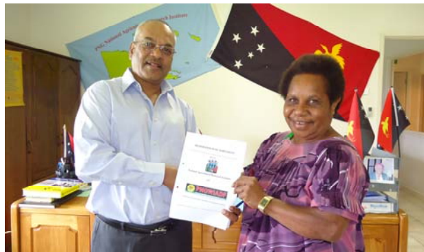
Long-term collaboration between scientist and farmer through MoU