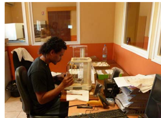
Lab assistant, Pouembout, New Caledonia, 2011 (IRD, Lemeur)