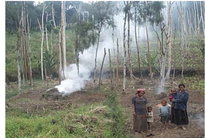
New garden creation in highlands (High Altitude Highlands of PNG, NARI)