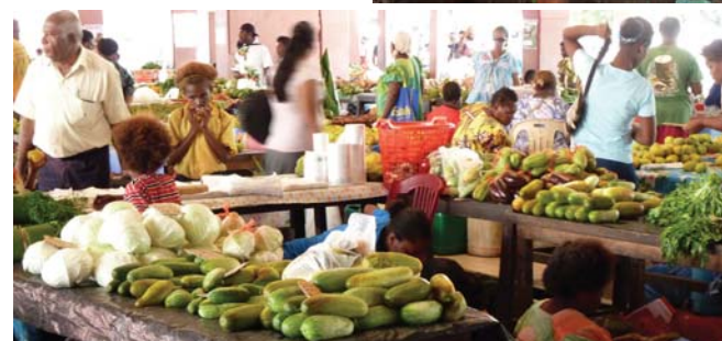
Daily market in Port Vila, Efate, Vanuatu (IRD, Le Meur)