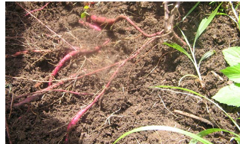
Poor yield due to excessive wet conditions (La Nina of coast and adjacent farm land)