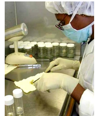
Tissue culture analysis (Keravat, NARI, PNG)