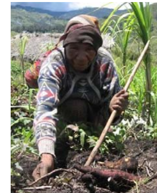
Harvesting sweet potato using a traditional tool (digging stick), (Tambul Plain, PNG, Bustin Anzu, Police Media, PNG, 2005)