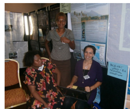
UPNG PACE-NET Stall, September 2012