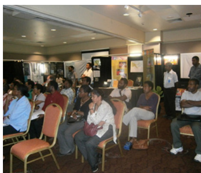
Annual Research Fair, September 2012

The National Research Agenda Workshop is aimed to assist the Office of Higher Education and the Office for Vision 2050 to develop a national strategic research agenda consistent with Vision 2050, The Development Strategic Plan (DSP), the Millennium Development Goals (MDGs) and other development goals. In addition, it is anticipated that thematic or key research areas within the Vision 2050, DSP, MDGs and other development plans are determined and areas of research priorities under thematic areas are proposed.